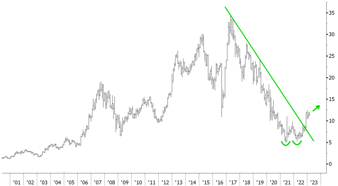
GEO Group (GEO)