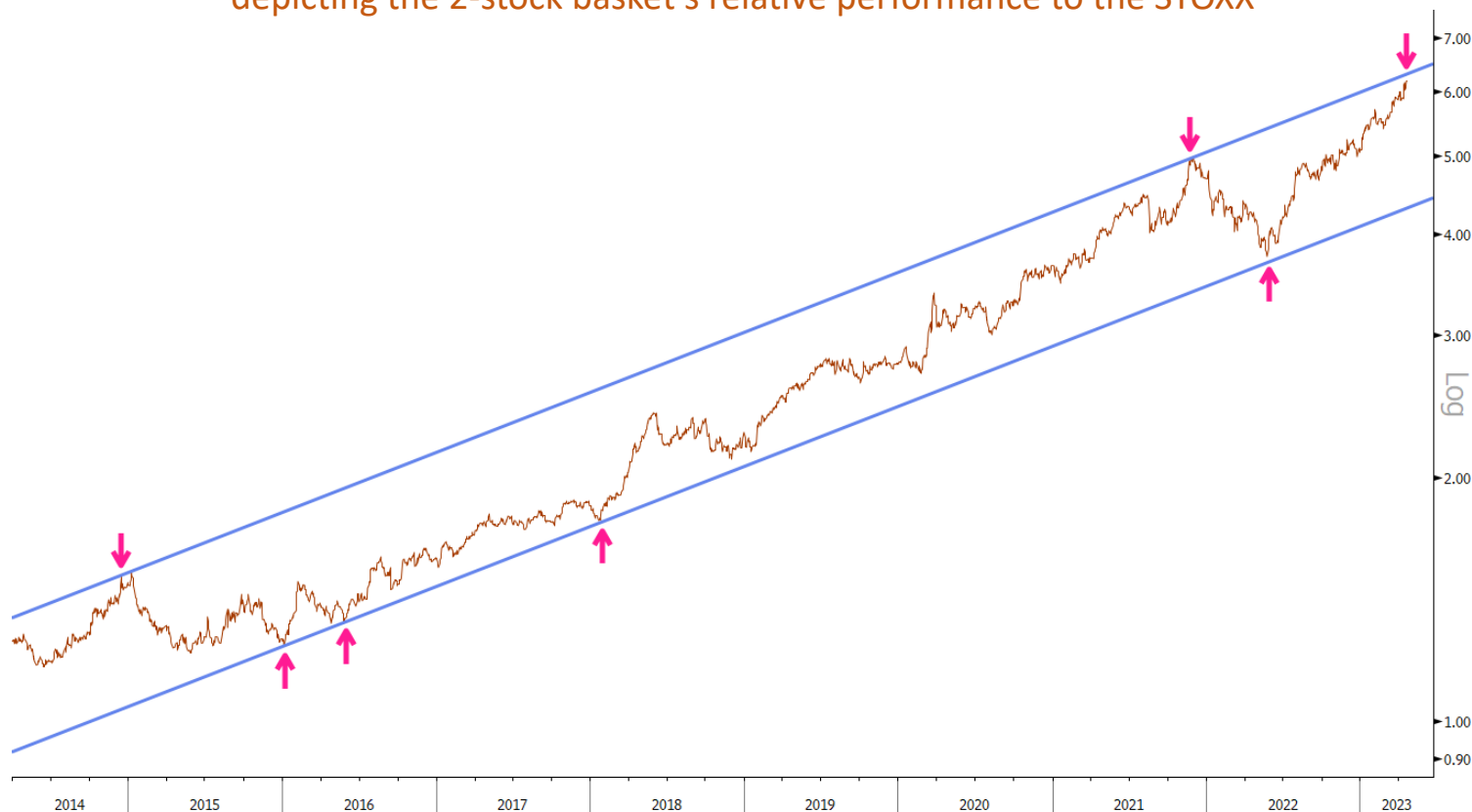
Ratio Chart: LVMH & Hermes Basket/STOXX Europe 600 Index depicting the 2-stock basket's relative performance to the STOXX