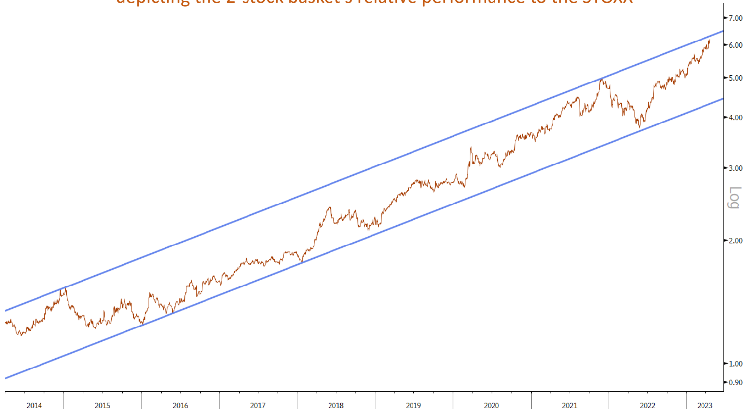
Ratio Chart: LVMH & Hermes Basket/STOXX Europe 600 Index depicting the 2-stock basket's relative performance to the STOXX