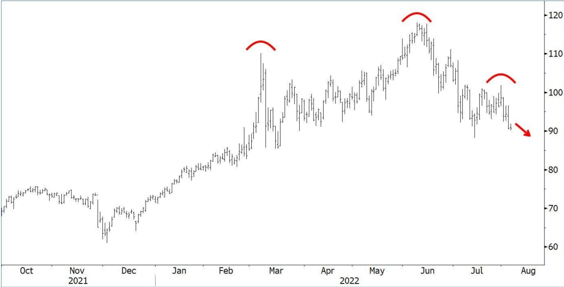
Identical WTI Crude Oil chart 3 of 4: