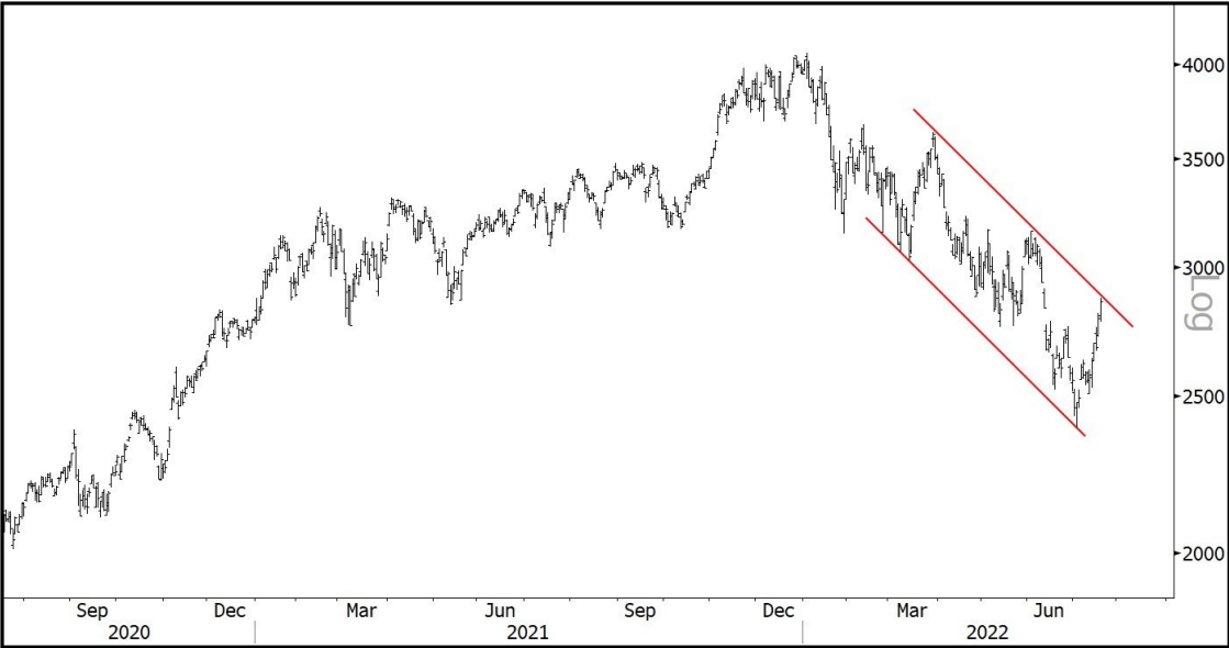
Identical 2-year SOX Index chart, 3 of 4 :