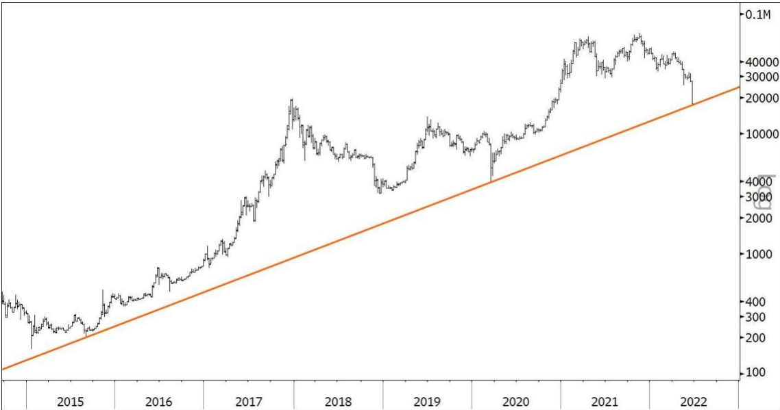
Identical Bitcoin chart 3 of 4: $17,730 last