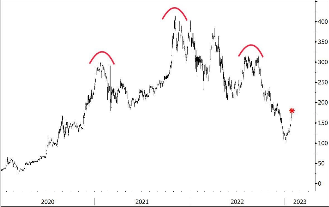
Tesla (TSLA) identical chart 5 of 6: