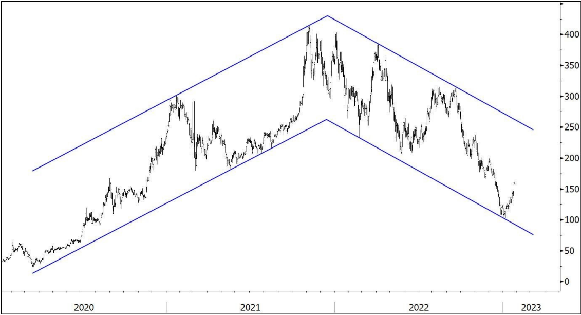
Identical Tesla Chart 3 of 5: