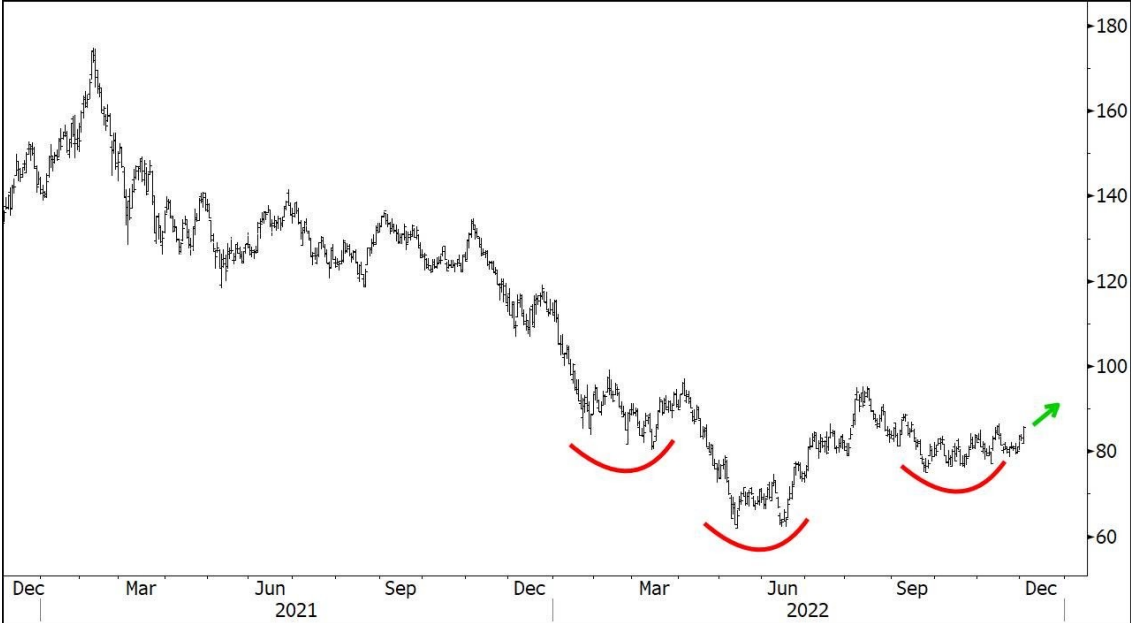
SPDR S&P Biotech ETF (XBI)... identical 2-year chart 3 of 4: